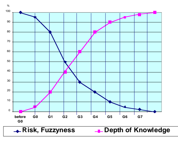
Figure 1. Levels of Risk and Knowledge in the Gate Model

2.3 Tailoring the Capability Maturity Model