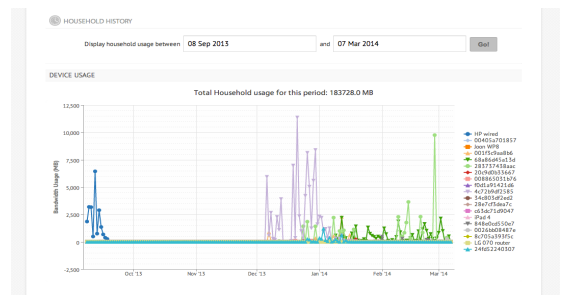
Figure 3. Monthly usage history timeline per-device.