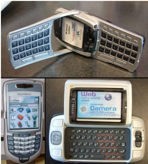
Figure 1. Nokia 6820 (top), RIM Blackberry (bottom left) and Danger/T-Mobile Sidekick (bottom right).