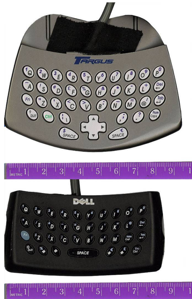
Figure 2. The modified Targus (top) and Dell (bottom) keyboards.

The study occurred in our usability lab with each of the two keyboards connected to a separate Pentium III workstation. We employed the Twidor software package (used in the series of studies on the Twiddler chording keyboard [2, 3]) and adapted it to accept data from our modified keyboards. The Twidor software was configured to use the MacKenzie and Soukoreff phrase set [7], a set of 500 phrases representative of the English language. The phrases range from 16 to 43 characters with an average length of 28 characters. The phrase set was modified to use only American English spellings and display only lower case letters and spaces (no punctuation or capitalization). Each test phrase was shown on the screen and remained there while the subject typed.