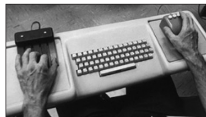
Figure 1. In addition to inventing the mouse, Douglas Engelbart invented the first chording keyboard in his pursuit of augmenting intellect.

Body-mounted sensors can see approximately the same view and be exposed to the same sounds as the user.