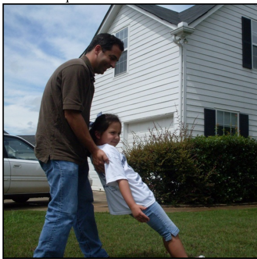
Figure 2 An example of the trust fall. The trust fall is a trust and teambuilding exercise in which one individual, the trustor, leans back prepared to fall to the ground. Another individual, the trustee, catches the first individual. The exercise builds trust because the trustor puts himself at risk expecting that the trustee will break her fall.

Consider, for example, the trust fall. The trust fall is a game played in an attempt to build trust between two or more people. One person simply leans backward and falls into the awaiting arms of another person (Figure 2). The trust fall will be used as a running example to explain our conditions for trust.