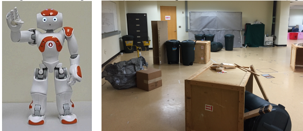
Figure 3. Robot platform (left) and Experimental Environment (right)

With the increasing use of autonomous robots in SAR, improving the interaction between human victims and rescue robots is critical. Similar to human cases, deception can be one efficient and essential capability for rescue robots in HRI. In this paper, we present an interesting and important research question in developing the use of robot deception in the SAR context; Can deceptive capabilities of rescue robots benefit human victims? We argued that a robot's deceptive capabilities can control a victim's emotional state and consequently establish a strong bond between victims and robots that lead to better cooperation. For this purpose, we introduced the computational model for a rescue robot's other-oriented deception inspired by criminological law. For the motive/opportunity parts, we proposed a deceptive action selection model using the CBR mechanism. Currently, we apply this model to a rescue robot system and are readying to conduct HRI studies (Figure 3) to evaluate the computational model and prove our research hypothesis.