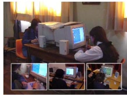
Figure 2. On site interaction with AudioBattleShip between two blind learners

The four learners enjoyed interacting with AudioBattleShip (see Figure 2). There were diverse forms of interaction between them. This is especially important for blind learners because they are accustomed to do individual work with little social interaction when using digital devices. Collaboration skills with obvious constrains can be enhanced with audio-based applications such as AudioBattleShip. We need to know what type of skills can be enhanced most and ways of improving them through the interaction with sound. A current full field study will give us detailed insights and knowledge about how cognition and collaboration can be enhanced by the interaction with sound.