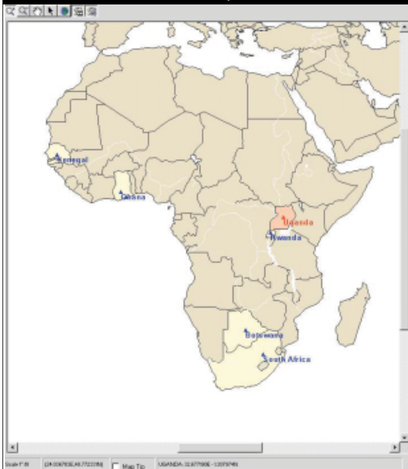
Figure 2. An automatically generated active map for a new story detailing President Clinton's trip to Africa. Uganda is currently mentioned in the audio. Selecting an area on the map allows a search for news stories that refer to the places in the selected area.

we have identified the correct coordinates for a location. If the location is not in the gazetteer, then we have no chance of providing the coordinates of this entity. If the words from the phrase describing the location were not in the speech recognition vocabulary, we again have no chance of providing the proper coordinates, even if we have properly identified the words as denoting a location. However, often locations are ambiguous in their coordinates. We then need to disambiguate different references to locations, for example, Washington may refer to a number of cities in the U.S., or it can refer to a state. A simple hierarchical disambiguation scheme has been implemented to distinguish among candidate coordinates: If a location is determined to be ambiguous, then we first check if other location references within the current news story disambiguate among the alternate locations. If the location is still ambiguous, then we see if other location references within a state or province favor a particular state. This way we can, for exam-