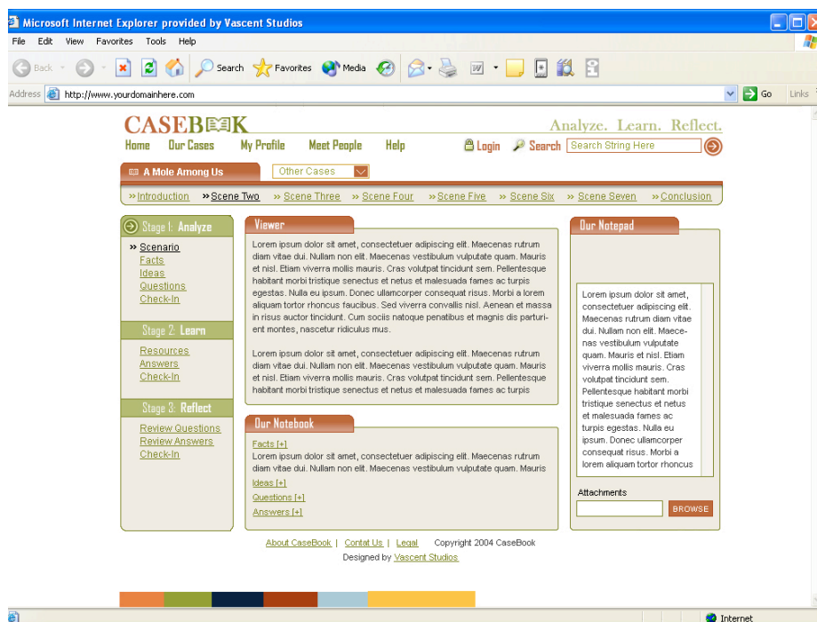
Figure 2. A screenshot of the CaseBook system.

CaseExplorer guides students through the PBL inquiry process (see figure below). Cases are divided into scenes. Students work on each scene in the three-stage process suggested by the PBL Cognitive Model: Analyze, Learn, and Reflect. In the Analyze stage, students elicit data about the problem (Facts), generate ideas and hypotheses (Ideas), and identify questions and gaps in their knowledge (Issues). The Viewer shows the problem statement (Scenario). Group members share a Team Notebook, in which they record their Facts, Ideas and Issues via an online NotePad. At the end of the stage, they CheckIn their Notebook which automatically publishes their information for the teacher to view and provide feedback.