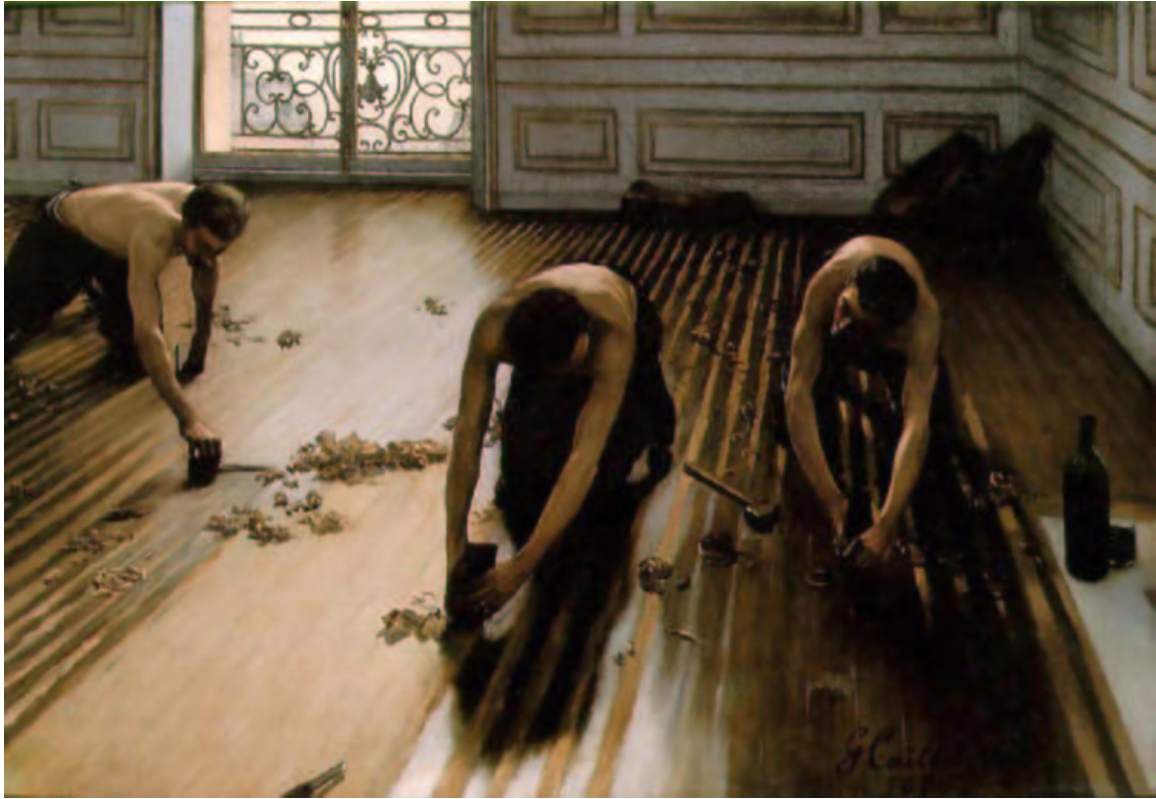
(1c) Floor Scrapers by Gustave Caillebotte