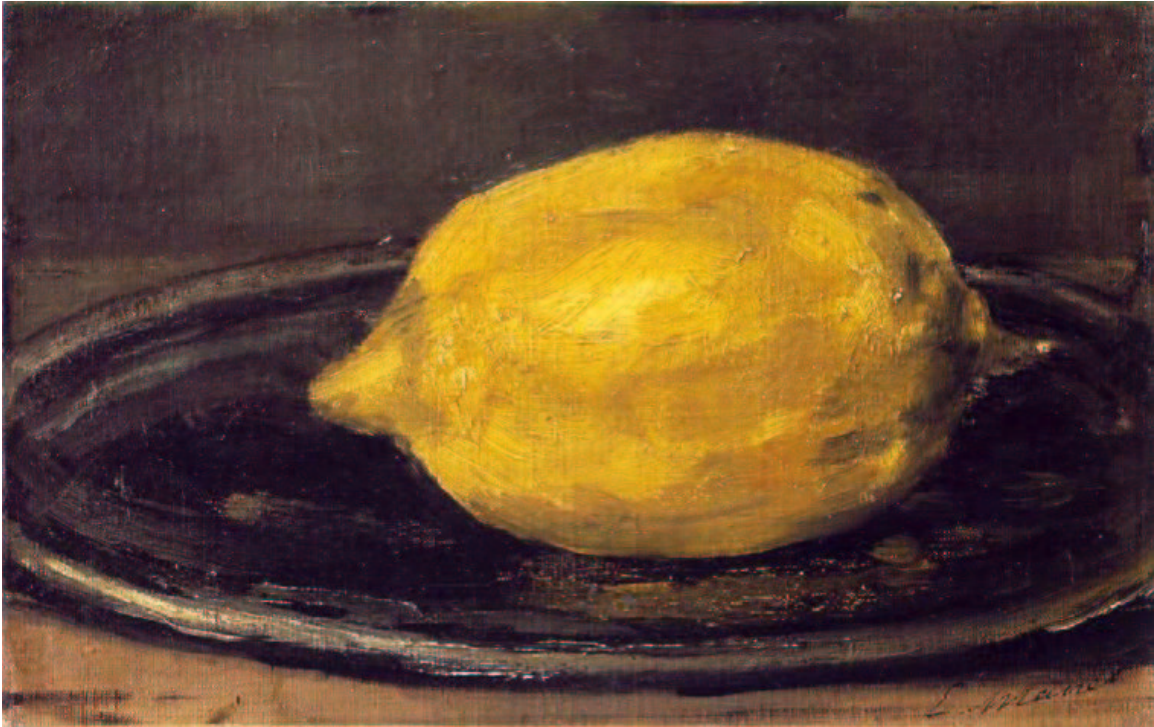
(1b) The Lemon by Edouard Manet