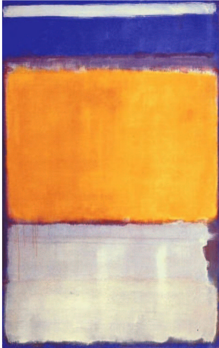
(2a) Number 10 by Mark Rothko

(2) Please rate your confidence in ability to execute the following paintings on a scale of 1 to 5, where 1 means “Not confident at all” and 5 means “Very Confident.”