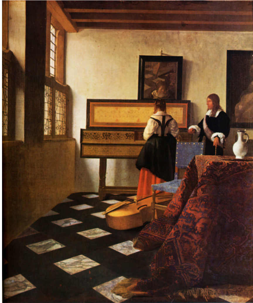
(2c) The Music Lesson by Johannes Vermeer