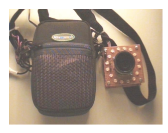
Figure 4: Gesture Pendant

Dragon<sup>8</sup>, a 3D battlefield visualization tool<sup>7</sup>. Our multimodal interface is based on speech and hand gesture, rather than speech and pen stroke in Quickset or speech and raycast strokes as in Dragon. The pen and stroke gestures require reference to a display surface. With a body mounted camera, users interact at a distance from the display.