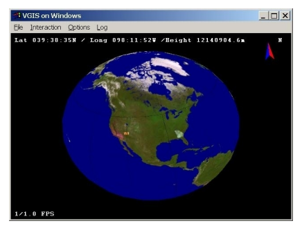
Figure 1: Orbital View from VGIS