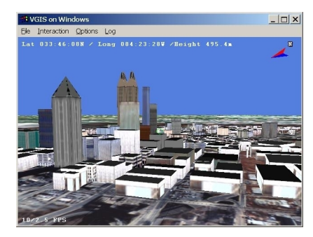
Figure 2: Surface View from VGIS

to understand the qualities and limitations of multimodal speech and gesture interfaces for particular tasks, rather than merely comparing performance with other interfaces.