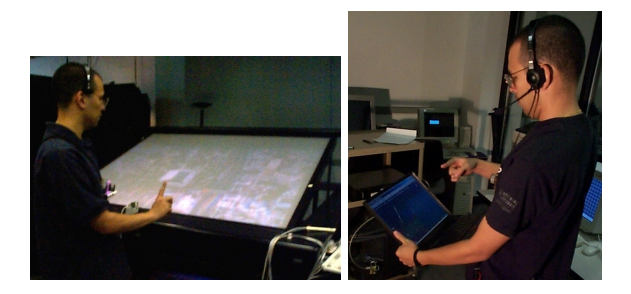
Figure 5: Workbench and Mobile Interfaces

voice recognition was slower. This mostly affected actions that required precise movements, such as when a user would try to position herself directly over a particular building. The multimodal interface with hand tracking was helpful in such actions. In future versions of this interface, we will be concentrating on two areas of improvement. We have already constrained the spoken word vocabulary and grammar of the recognizer, making recognition faster and more accurate. We will also be increasing the accuracy and precision of the gesture interface.