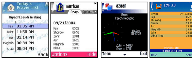
Figure 1: Khashee, mAthAn, MobileAzaan, and Athan Time

Despite evidence pointing to the use of imagery in religious experience, we were surprised that commercially available Muslim call to prayer applications did not fully incorporate it. Existing systems typically rely on text and numbers to communicate prayer times (e.g., interfaces in Figure 1 represent a range of popular commercial systems). Further, we learned during our project’s exploratory phase [9] that precise times are not necessarily the most appropriate way to communicate the right time to pray. Instead, Muslims described prayers as happening during a “window of opportunity”, rather than an exact moment. They explained that prayer requires worshippers to transition from a secular state to a sacred one, in addition to the actual prayer time itself [10]. Specifically, prayers begin with a call, or adhan, that traditionally occurs 15 minutes prior to the precise prayer time. Following the call, Muslims prepare for prayer. This includes washing body parts (ablution) and then performing two to four ritual cycles (raka’ahs) while facing Mecca’s direction (qiblah). Understanding that prayers took place during a window of opportunity rather than an exact time inspired us to design an application that relied on imagery, rather than text and numbers. We thought this more appropriately reflected the belief expressed by participants that prayers are flexible and open-ended rather than a precise and rigid event.