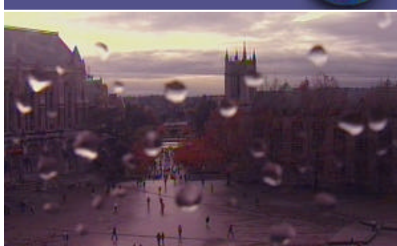
Live View of Seattle Campus 11/8/2002 9:27am

Seattle Area Weather: Temperature: 51F, 11C (44F, 7C wind chill). Winds: 8 mph from the SE (10 mph gusts). Barometric pressure: 29.18 in (988 mbar). Relative humidity: 78%. Seattle forecast . The sun rose today at 7:05 and will set at 16:42. The moon is waxing crescent with 20% of the moon's visible disk illuminated.