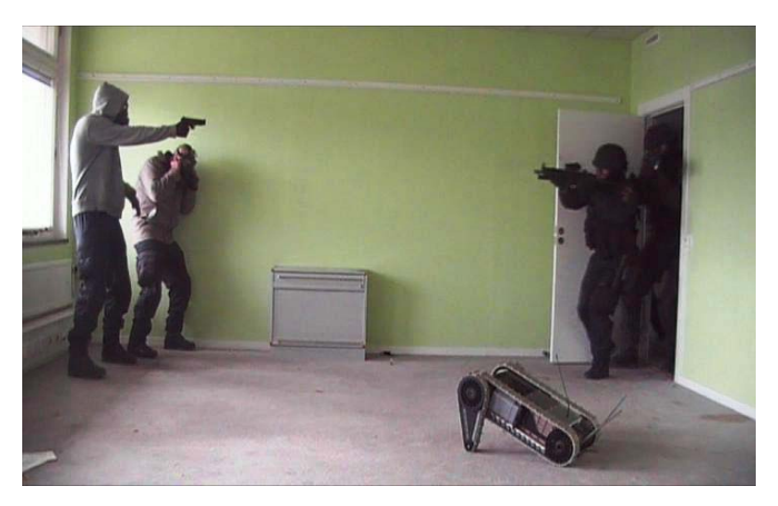
Figure 3. Tactical test of the distraction-siren. From left to right: the officer acting as criminal; the officer acting as hostage; the two SWAT-officers attacking. The hostage taker was instructed to shoot at the police, which he succeeded in despite the siren. The hostage immediately plugged his ears with his fingers. The electronically filtered hearing protection used by the police protected them from the noise.

The distraction-siren payload was evaluated in a mock hostage situation during which one officer acted hostage taker and one officer acted hostage; both were previously unacquainted with the distraction-siren. The test showed that the noise, although extremely annoying, does not completely disrupt willpower (Figure 3).