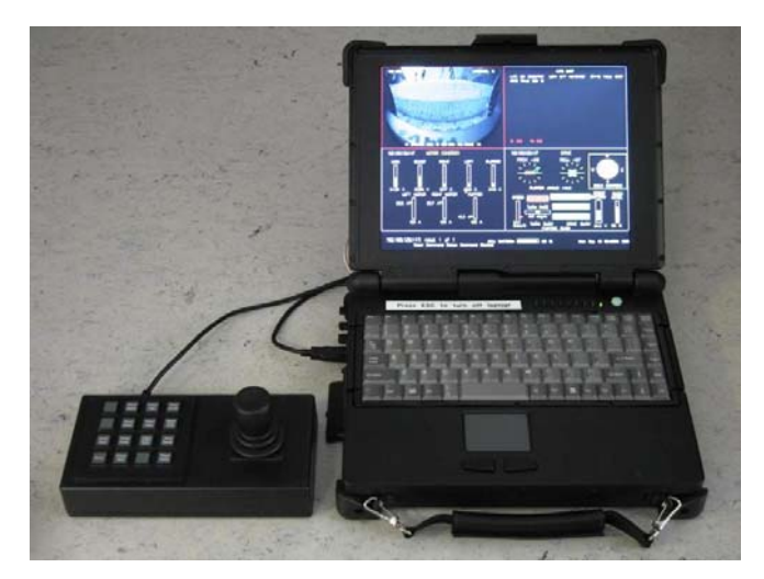
Figure 2. The operator control unit.

The operator control unit consists of an Amrel Rocky Patriot rugged laptop fitted with a joystick<sup>22</sup> allowing for three degrees of freedom, and a keypad for toggling functions on/off (Fig. 2). Communication between the robot and the user interface is achieved using double IEEE 802.11b radio links.