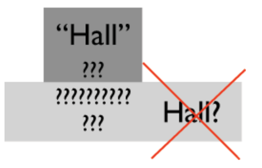
Fig. 2. A illustration of two regions, not clearly separated by a door or other common border, but with distinct meaning to the human user.

A very similar approach to an integrated system for "Human Augmented Mapping" is reported by Zender et al. [14]. Their system concentrates though more on the conceptual/semantic level of the mapping process as far as the interaction and higher level functionalities are concerned.