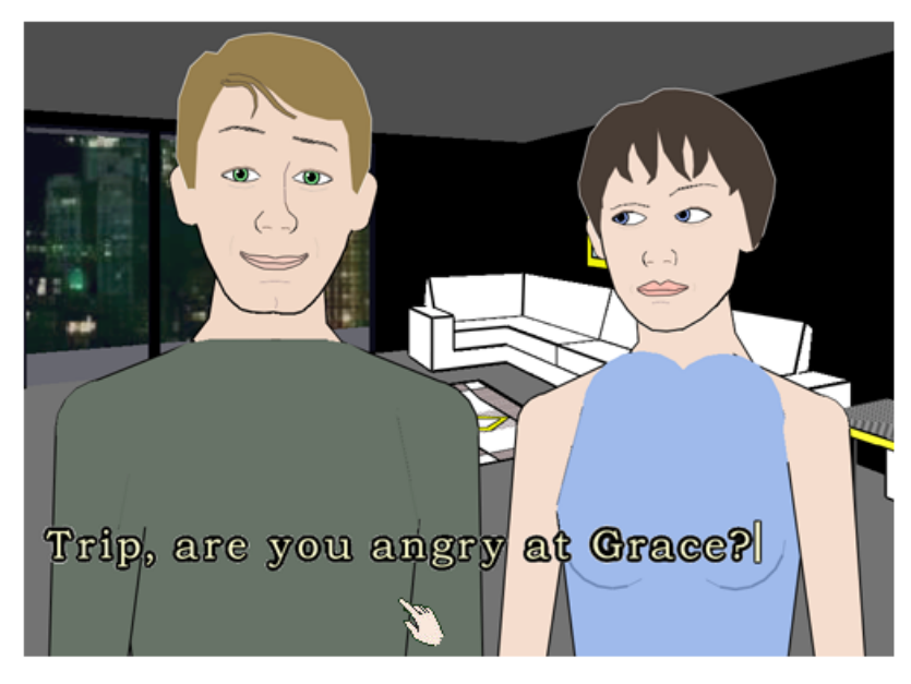
Figure 1. Real-time rendered characters Grace and Trip in Façade, with player-typed text and hand cursor.

thirties. During an evening gettogether at their apartment that quickly turns ugly, you become entangled in the high-conflict dissolution of Grace and Trip's marriage. No one is safe as the accusations fly, sides are taken and irreversible decisions are forced to be made. By the end of this intense oneact play you will have changed the course of Grace and Trip's lives - motivating you to replay the drama to find out how your interaction could make things turn out differently the next time.