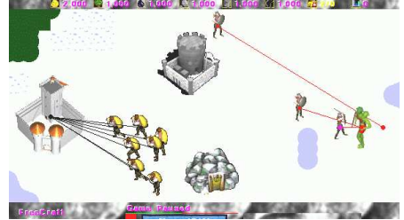
Figure 1: Freecraft strategic domain with 9 peasants, a barrack, a castle, a forest, a gold mine, 3 footmen, and an enemy, executing the generalized policy computed by our algorithm.

The idea of generalization has been a longstanding goal in Markov Decision Process (MDP) and reinforcement learning