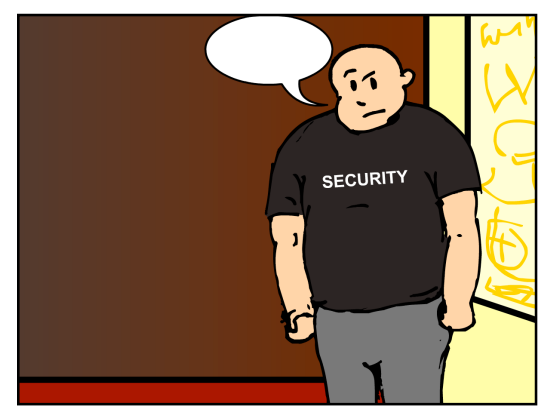
Figure 1(c). An encounter with a security guard.

Figure 1. Screenshots from the prototype social skills learning system. These screens show what the user may see as he or she navigates through the process of going to the theatre.