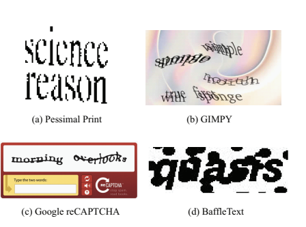
Figure 1: Examples of visual CAPTCHA.