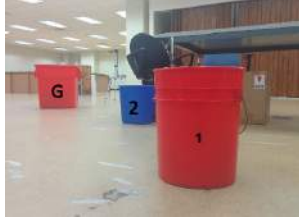
(c) Location 3 with two waypoints