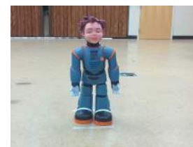
(a) The key object

The navigation algorithm was executed on the robotic platform until 10 successful trials were obtained. The number of failed trials that occurred before the completion of the 10 successful runs was noted as the fail rate. Hence for each