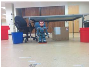
Fig. 6: Experimental scene for object-based advice-giving

The test scene consisted of several planar and non-planar objects kept at varying depths. The key object is the Zeno