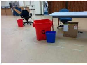
(a) Location 1 with no waypoints