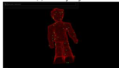
(b) Pcd file of the object