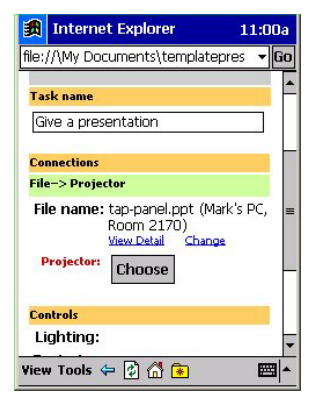
Figure 3: A partially configured template. In this case the user has selected the file to be presented but has not yet selected the projector.

This latter effort began by developing a higher-fidelity, interactive, "mockup" prototype in HTML. We developed the prototype and iterated on it, gaining valuable experience by employing walkthroughs and user evaluations between iterations. In order to simulate an environment in which a myriad of components would be available, we populated the mockup with several dozen components to choose from, as well as about a dozen templates representing potentially useful tasks (e.g., give a presentation, share my slides, listen to voice mail, capture the whiteboard, print a document, etc.).