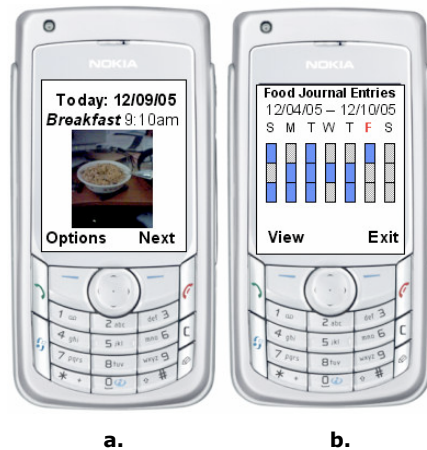
Figure 2. 2 screenshots of the FotoFit cell phone interface.

b. Users can see which meals they have taken pictures of. This can be useful if the user wants to see which days they forgot to eat breakfast. Each day starts off as a grey bar with three segments, the bottom corresponding to breakfast, the middle to lunch and the top to dinner. When a food entry is added, the corresponding segment of the bar is colored.