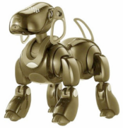
Figure 1. MIT researchers developed an approach to weight loss tracking that centered on a robotic dog (the Sony Aibo™ device that they utilized is shown above) [2]. The system is composed of a wireless pedometer and a PDA form for textual journal entry. The robot has wireless access to information from these devices and modifies its behavior depending on the user's information. One of the goals of this research is to help users be more aware of their fitness progress. Our system design was motivated in part by this same goal.

The process of journal keeping is another effective way of becoming aware of one's diet and exercise habits [5]. Many current journaling systems are implemented as web applications (e.g., www.fitday.com ). Such websites allow individuals to keep a textual log of what they eat and how they exercise. Visualization is usually provided using charts and graphs to show the user's progress over time. One drawback for the user is that when they do not have internet access during the day, they may need to keep a mental or written record of their activities until they are able to login to the application. The Fitlinxx system partially removes that burden by automatically tracking workouts on gym exercise machines ( www.fitlinxx.com ). In our design we have tried to further compensate for this problem by utilizing the cell phone platform, a device that many people have with them continuously throughout the day.