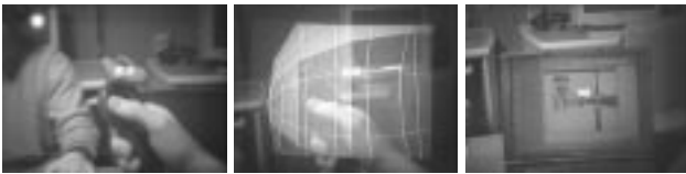
Figure 3. Drag & drop of virtual objects. A virtual object is picked up using a 3D pointing device (left image), dragged to a laptop, whose spherical bounding volume highlights, and dropped onto it (center image). The object then appears on the laptop’s screen (right image).

By hybrid interaction , we mean those forms of interaction that cut across different devices, modalities, and dimensionalities [18, 35, 32, 33]. For example, to use a workstation in the physical environment and the wall-sized display connected to it to display an object in the 3D virtual space, we have to provide a way to move data back and forth between the 2D desktop of the workstation and the 3D virtual space surrounding us.