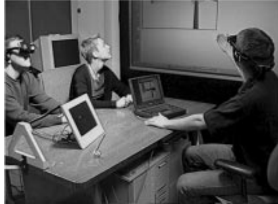
Figure 1. A meeting situation using EMMIE. Two users wear tracked see-through head-worn displays, one of whom has also brought in his own laptop. The laptop and a stylus-based display propped up on the desk are also tracked. All users can see a wall-sized projection display. The triangular source for one tracker is mounted at the left of the table; additional ceiling-mounted trackers are not visible here.

In analogy to the window manager of a 2D GUI, we use the term environment manager to describe a component that organizes and manages 2D and 3D information in a hetero-