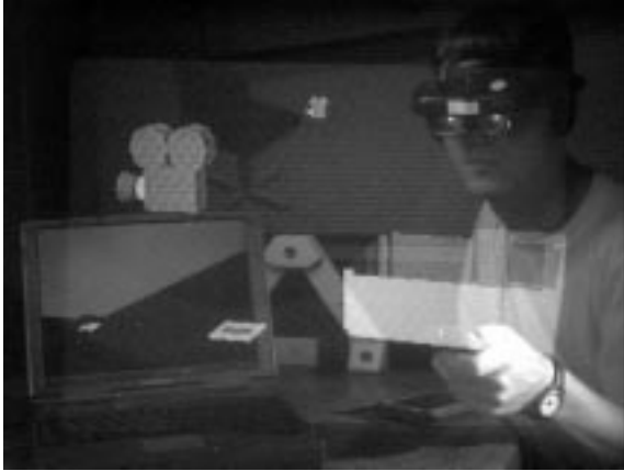
Figure 2. A user manipulates a 3D model with an optically tracked hand-held pointer. Other virtual objects shown include simple iconic 3D representations of applications (e.g., a “movie projector” that can play videos) and data objects (e.g., “slides” that represent still images).

puters provide displays ranging from wall-sized to palm-sized, and various interaction devices, such as keyboards, mice, touch pads, and pens. Each of the workstations, PCs, laptops, and PDAs runs its own unmodified operating system and 2D GUI.