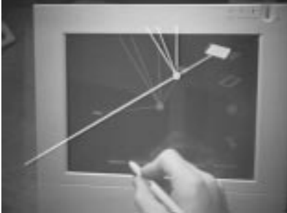
Figure 5. A simple interactive search mechanism creates 3D leader lines emanating from the tracked display to objects satisfying the query.

leader lines are virtual objects, they are visible in the see-through head-worn displays as well as in the magic mirror. Readjusting the search criteria causes the set of leader lines to change interactively, implementing a dynamic query facility [1] embedded in the 3D world.