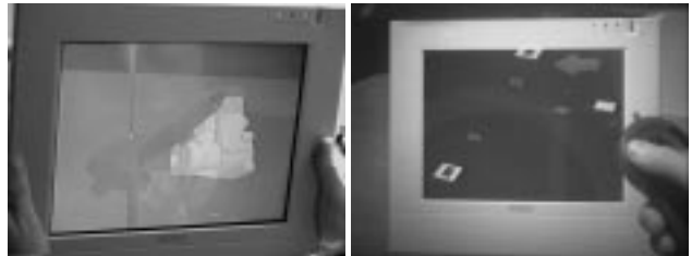
Figure 4. The same display tablet can serve as physical magic lens and magic mirror. In the left picture a user not wearing a HMD is looking through the magic lens at a 3D CAD object. In the right picture a user wearing a HMD has just dragged a virtual image slide in front of the mirror for further inspection.

visible and useful representation for the data in the virtual environment while it is being moved between the physical machines. (The presence of this representation also raises a variety of privacy issues, which we discuss later.)