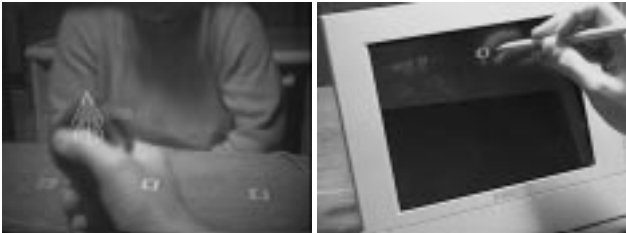
Figure 6. A user changes the privacy status of an object by moving a privacy lamp above it