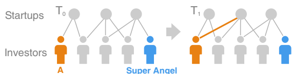
Figure 2: Investor A’s InvestorRank improves at time T_1 , thanks to the new investment (orange edge) that brings A closer to the super angel.

startup represents an investment. This graph includes the exemplar investors, the startups they invested in and any other investor that invested in those startups. We generate this time-varying graph using data from CrunchBase 1 , a socially-curated website containing information on startups and fundings, obtained in December 2013. This dataset contains 56,847 investments made in 19,375 startups by 11,096 investors. We take snapshots of the graph at regular intervals, using a sliding window of width \omega (e.g., 3 quarters). Thus, an edge in a snapshot represents an investment made in that time window. Together, these snapshots form the time-varying investor collaboration network. Figure 3 shows an example subgraph in a snapshot.