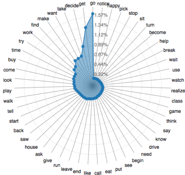
Figure 3: Distribution of top 50 events in our corpus.

gram sequence. For this analysis we set n=5 , where the mean number of tokens in titles is 9.8 and median is 10. The ‘end’ token distinguishes the actual ending of a title from five-gram cut-off. This figure demonstrates the range of topics that our workers have written about. The full circle reflects on 100% of the title n -grams and the n -gram paths in the faded 3/4 of the circle comprise less than 0.1% of the n -grams. This further demonstrates that the range of topics covered by our corpus is quite diverse. A full dynamic visualization of these n -grams can be found here: http://goo.gl/Qhg60B .