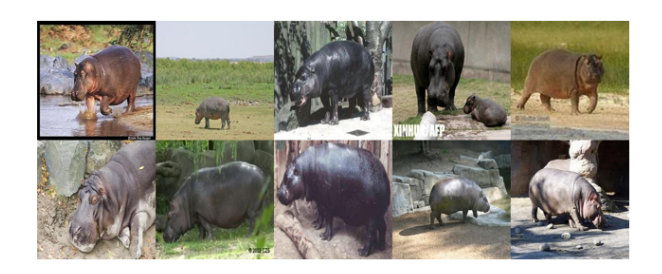
Has bulbous/bulging/round body Is a coastal animal

For each montage shown below, please tell us which 1 of the 4 properties/attributes of the animal pops out at you. In other words, if you had to describe all photographs of the animal in the group or montage using only 1 property or attribute from the given 4 choices, what would that property be?