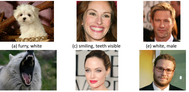
(b) sharp teeth, scary (d) wearing lipstick, heavy makeup (f) bearded, wearing glasses

Figure 1: Different attributes pop out at us in different images. Although (a) and (b) are both white and furry, these attributes dominate (a) but not (b). Smiling and wearing lipstick stand out in (b) and (c) because of their strong presence. Glasses and beards are relatively unusual and stand out in (f). Some attributes like race and gender are inherently more salient (e).