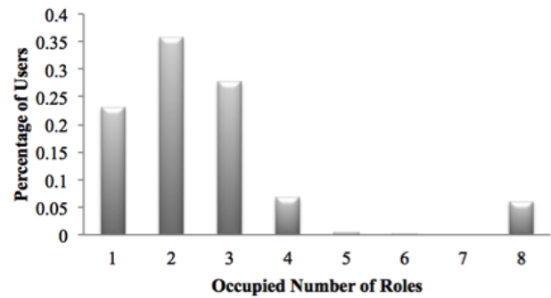
Figure 2: Distribution of Occupied Number of Roles.

are not directly reflected by simple edit counts in different namespaces.