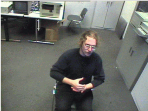
Figure 2: View from the desk-based tracking camera. Images are analyzed at 320x240 resolution.

Training for a second-person viewpoint is appropriate in the rare instance when the translation system is to be worn by a hearing person to translate the signs of a mute or deaf individual. However, such a system is also appropriate when a signer wishes to control or dictate to a desktop computer as is the case in the first experiment. Figure 2 demonstrates the viewpoint of the desk-based experiment.